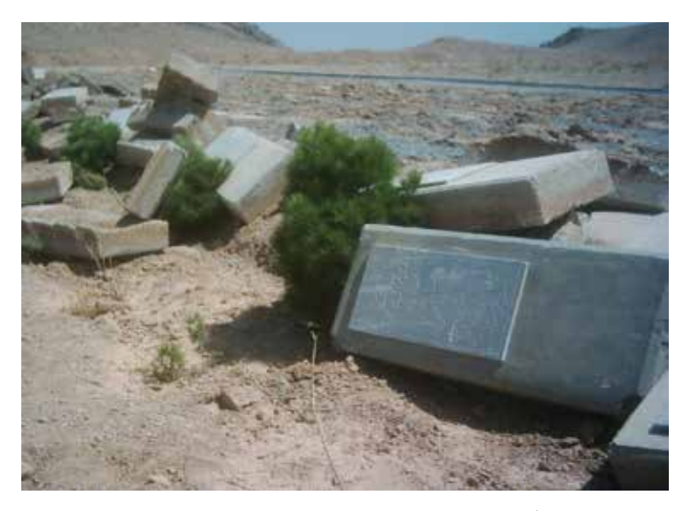
Gravestones in the Bahá'í cemetery near Najafabad, Iran, were left in a heap by a bulldozer that destroyed the burial ground in September 2007.

Nevertheless, the Bahá'í International Community has managed to document the following from 2005 through 2012: