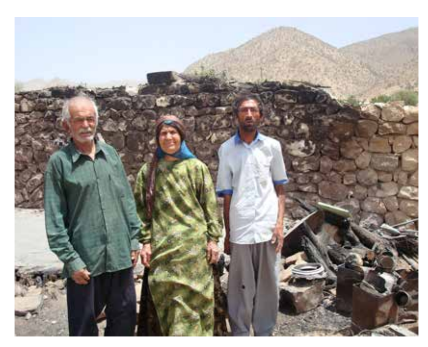
On 10 June 2008, a Bahá'í family in the village of Tangriz in Fars Province narrowly escaped injury when an arsonist caused a fire that destroyed a hut near where they were sleeping.

In Rafsanjan that same month, on 25 July, the car of a prominent Bahá'í was torched and destroyed by arsonists on motorbikes. The man and ten other Bahá'í families in the town had received threatening letters from a group calling itself the Anti-Bahá'ísm Movement of the Youth of Rafsanjan that, among other things, threatened "jihad" against the Baha'ís.