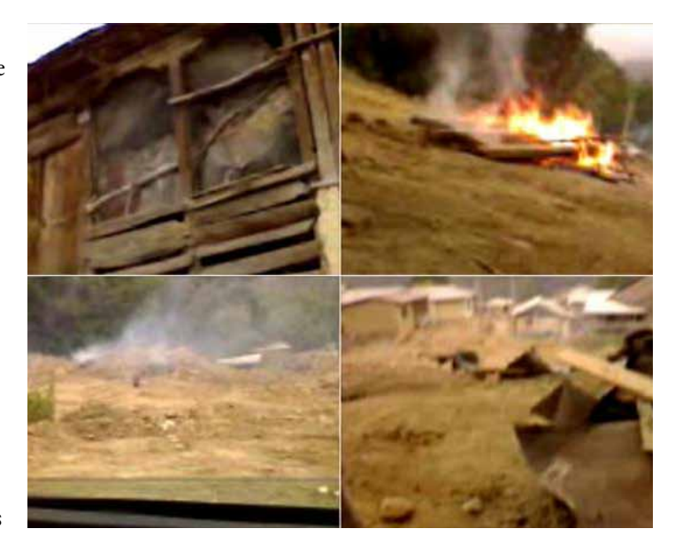
Scenes after the destruction of some 50 unoccupied Bahá'í homes in the village of Ivel in 2010, taken from a video shot on a mobile telephone and showing fiercely burning fires and several homes reduced to rubble.

These violent incidents—undertaken by unknown individuals or plainclothes agents—are associated with a long history of official court