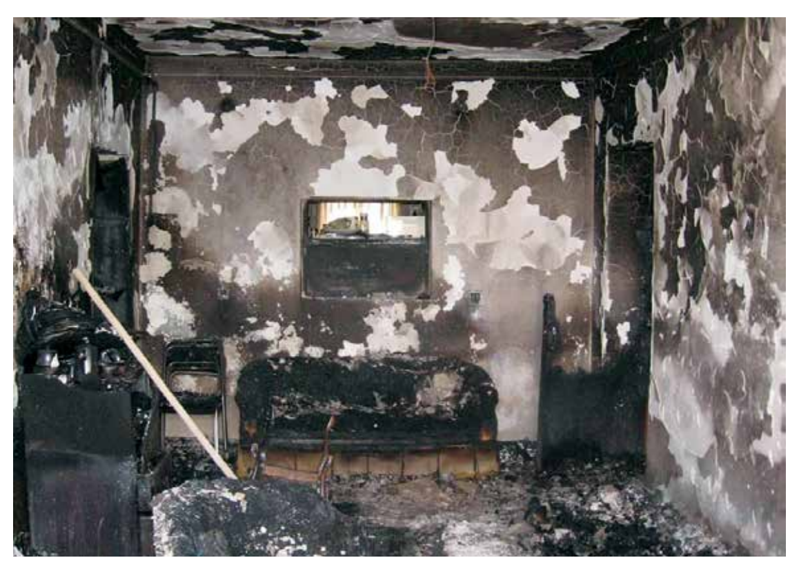
The home of a Bahá'í family in Kerman was gutted by fire on 18 July 2008. Family members had received theatening phone calls, and their car was also hit by arsonists.

Should the conditions be accepted by the recipients, the letter states, "we will guarantee not to wage any attack on your life and properties."