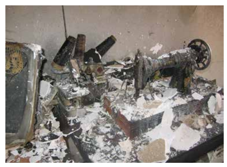
Interior view of a Bahá'í home in Kerman that was hit by arsonists on 18 July 2008.

Taken altogether, this use of "plainclothes" violence makes up a significant part of Iran's overall policy of persecution against Bahá'ís. The rise in violence comes amid the intensification of a state-sponsored media campaign that has sought to vilify and demonize Bahá'ís in Iran.