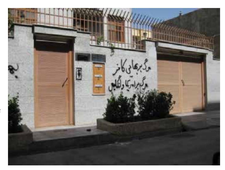
A home in Semnan sprayed with offensive graffiti which, when translated into English, reads: "Down with the pagan Bahá'í. Down with America and Britain."

On 26 June 2011, local police summoned all 17 Bahá'í families in Kata and told them of an order from the justice administration that said they were indeed now obligated to hand their lands over to Muslim tenants. The Bahá'ís refused, saying they would continue to fight the order in court. About three weeks later, five Bahá'ís from Kata were arrested and ultimately sentenced to six months in prison on the charge of forcible possession of properties. The court also ruled that the lands must be handed over to the Muslim tenants.